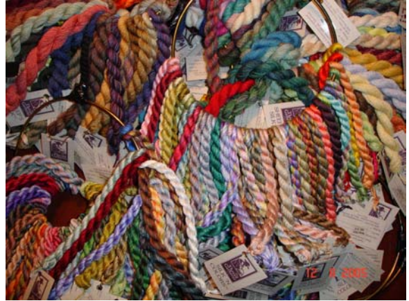
Rings of Threads. . .

Phoenix Rising so this is a perfect Autumn, Halloween color.